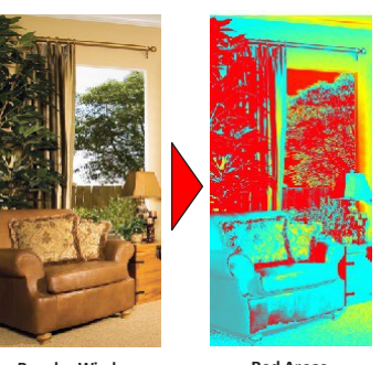
ular Window Red Ar

This Thermal image shows how a window with ShutterSmart EnergyGuard reduces energy loss when compared to a plain uncovered window. Notice the significant reduction in heat when ShutterSmart EnergyGuard Shutter Insulation System is used. ShutterSmart EnergyGuard Shutter Insulation System delivers up to a 30 degree protection against outdoor heat and cold extremes.