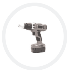
RECHARGEABLE, VARIABLE SPEED 3/8" DRILL

For this process you will need the following tools: