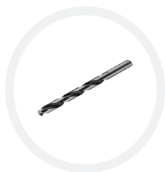
3/8" DRILL BIT