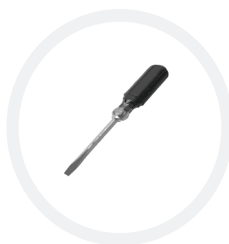
FLAT HEAD SCREWDRIVER